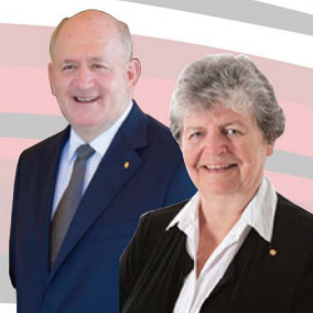
General The Honourable Sir Peter Cosgrove AK CVO MC (Ret'd)